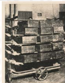
Brotwagen mit gefüllten Backkästen und Einschießen der Schwarzbrote in einer Pumpernickelbäckerei um 1930. Kopie aus: Carin Gentner, Pumpernickel - Das schwarze Brot der Westfalen, Detmold 1991.