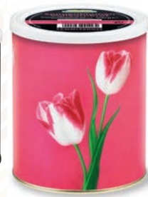
Panem et Artes 2010 „Tulip 2006“, by the Chinese painter Zhou Tiehai.