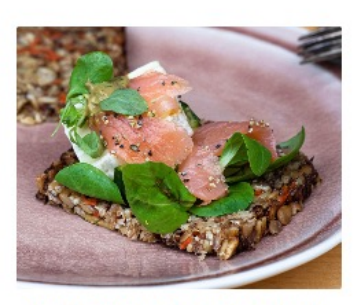
MESTEMACHER AUTUMN RECIPES