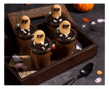
Recipes for Halloween Mestemacher bread