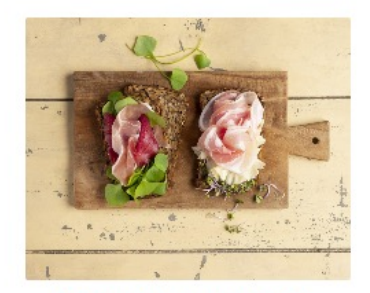
MESTEMACHER RECIPES FOR AUTUMN WITH PURE NATURAL BREADS