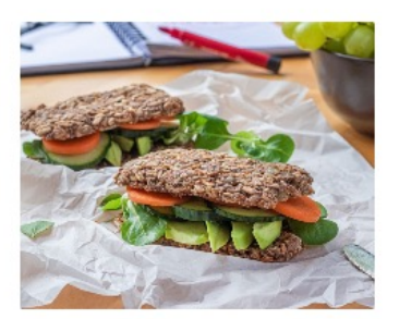
Recipe ideas for the office with Mestemacher bread