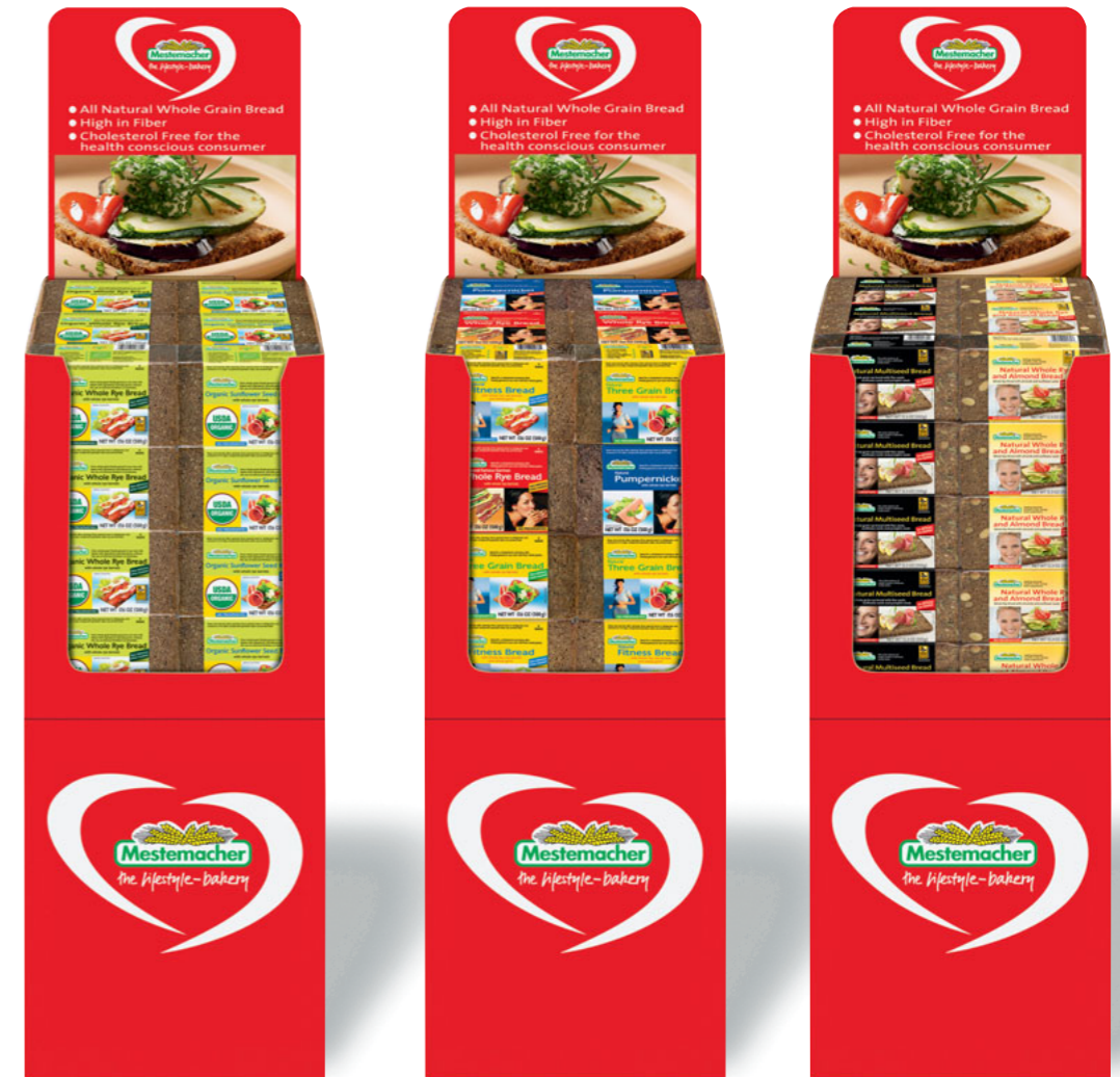
Mestemacher displays in a bright look for incremental sales.