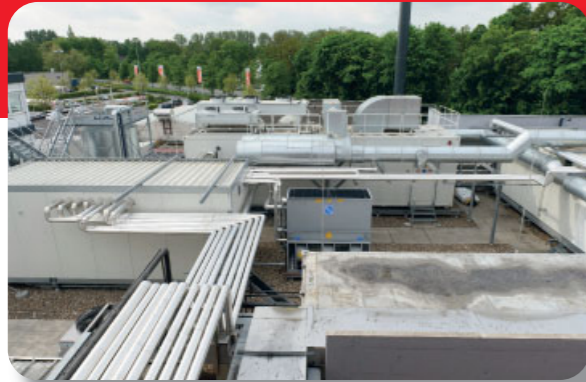
The combined heat and power station is part of Mestemacher's energy concept.

The combined heat and power station at Mestemacher's large-scale bakery