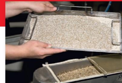
Whole grain rye is ground into coarse flour in our in-house mill.