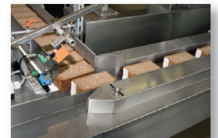
The freshly baked bread is cooled, then cut into slices and automatically transferred to the packaging machine..