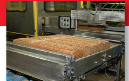
The finished loaf of bread is turned out of its baking tray.